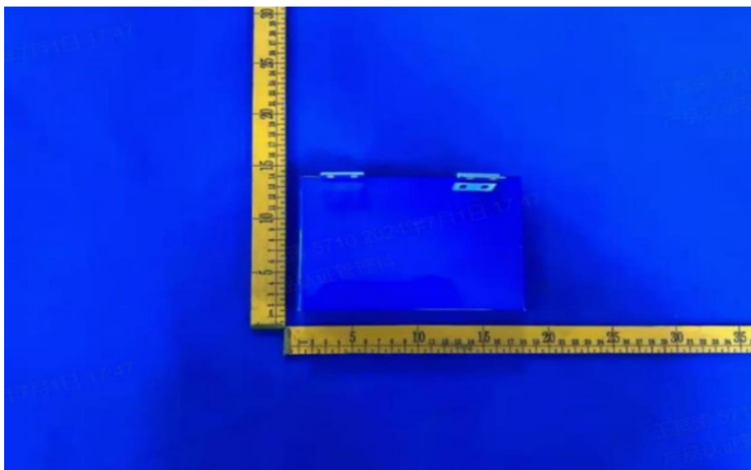
Picture 4. Back view of cell 图片 4. 电芯后视图