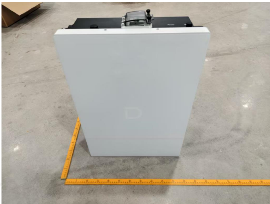
Picture 2. Back view of battery