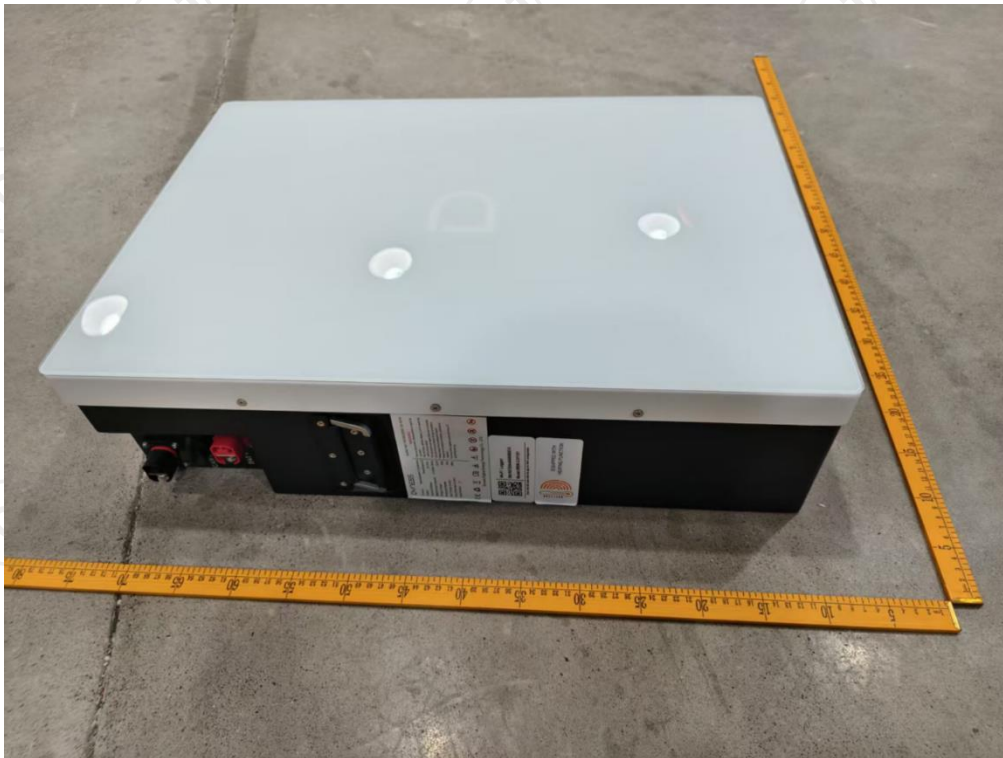
Picture 1. Front view of battery